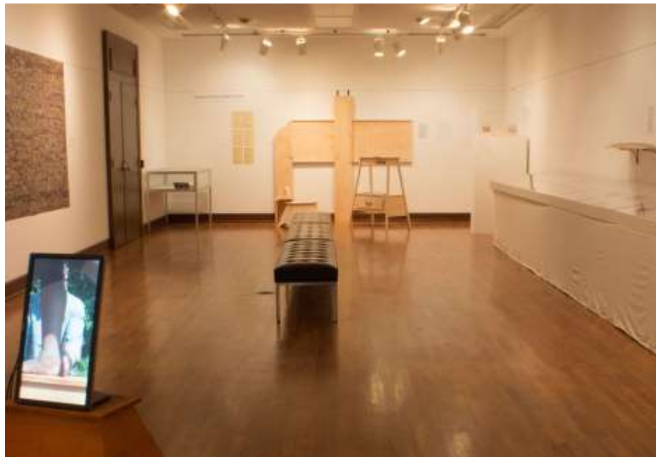
Figure 3 Installation view of Data (after)Lives with reconstruction of the Bertillon machine, Bertillon cards, and artistic interpretations of Bertillonage by Aaron Henderson, Alison Langmead, and Sam Nosenzo, 2016.