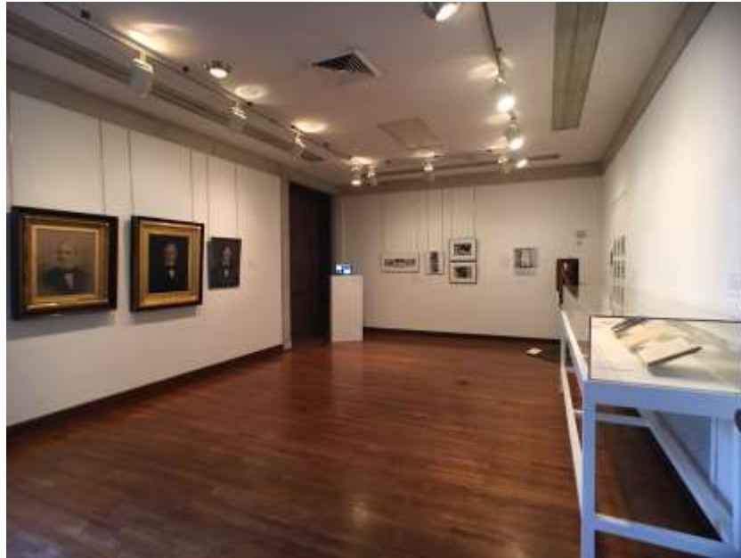
Figure 2 Installation view of Data (after)Lives with Landscapes of Human Identity in the University of Pittsburgh Art Gallery, Pittsburgh, 2016.