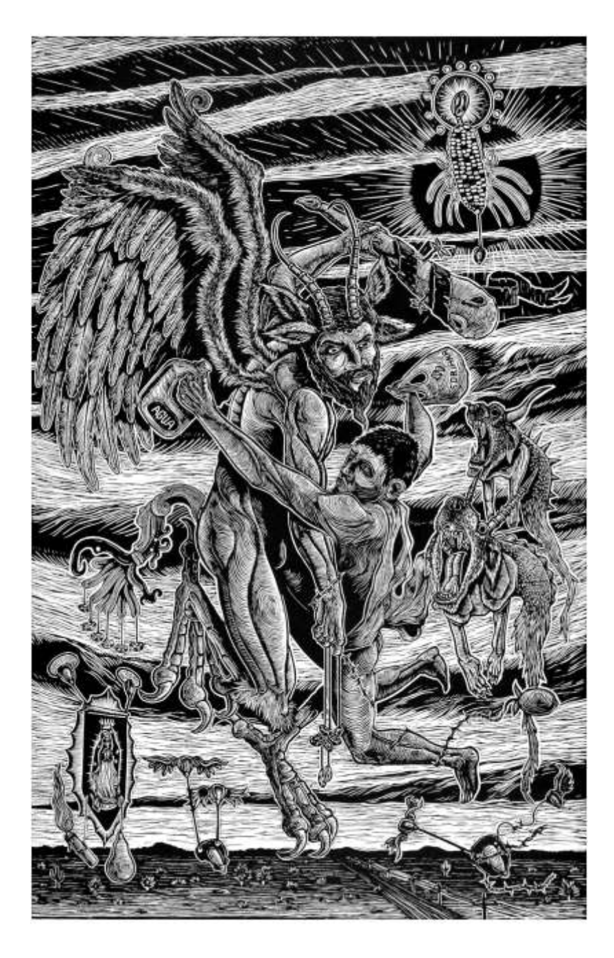
Figure 3 Juan de Dios Mora, Abduction of the Immigrant, 2009, linocut, 22 \times 30 in.