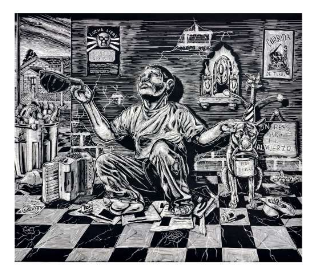
Figure 4 Juan de Dios Mora, A Coin for Breakfast , 2010, linocut, 26 x 27 ¼ in.

I made a road on the bottom. That means that many times in the desert there are roads around, but they are for ranchers, or for the migra . If you look closely, there is nothing around other than telephone poles. Many times, people walk on those roads, but if they do so they can leave their traces increasing their chances of being caught by the migra . Nonetheless, the road can provide an opportunity for survival, because if immigrants are tired, they can sit on the road until somebody gets there and rescues or reports them. To reiterate, the road can be a lifesaver, but if immigrants get caught, the American dream would be out of reach. I want to emphasize that these roads are more for last chances, when immigrants are about to die.