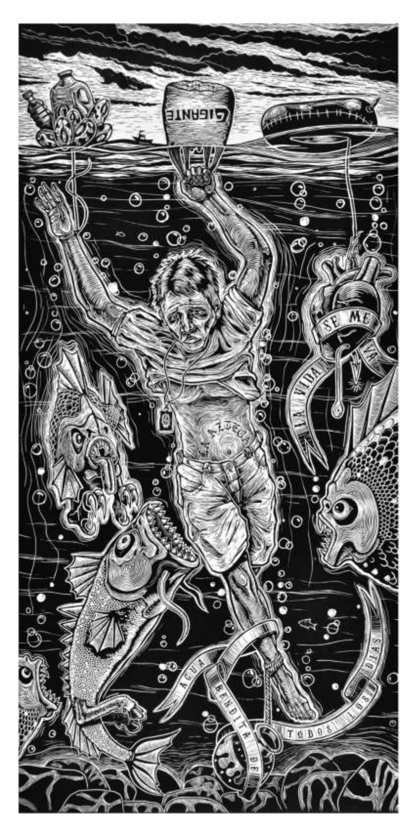
Figure 2 Juan de Dios Mora, Attacked by Fishes, 2009, linocut, 24 ¾ x 12 in.