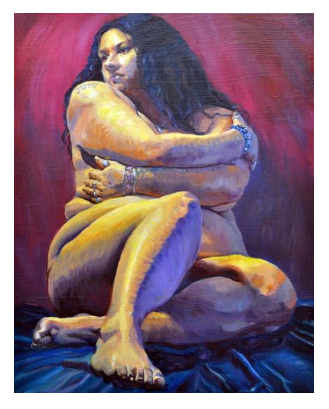
Figure 3 Cecelia Ivy Price, Coming to Confidence III , 2014, Oil on Canvas.