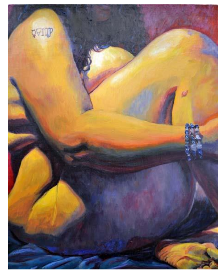
Figure 1 Cecelia Ivy Price, Coming to Confidence I , 2014, Oil on Canvas.

about in biology class. I think the nudity and skulls in my work are reminders that we are all different and all the same, at once. We are all skeletons underneath, and we are all naked under our clothes; what is different is our personalities. This body of work also touches on sexual abuse, a nuance some viewers have not recognized.