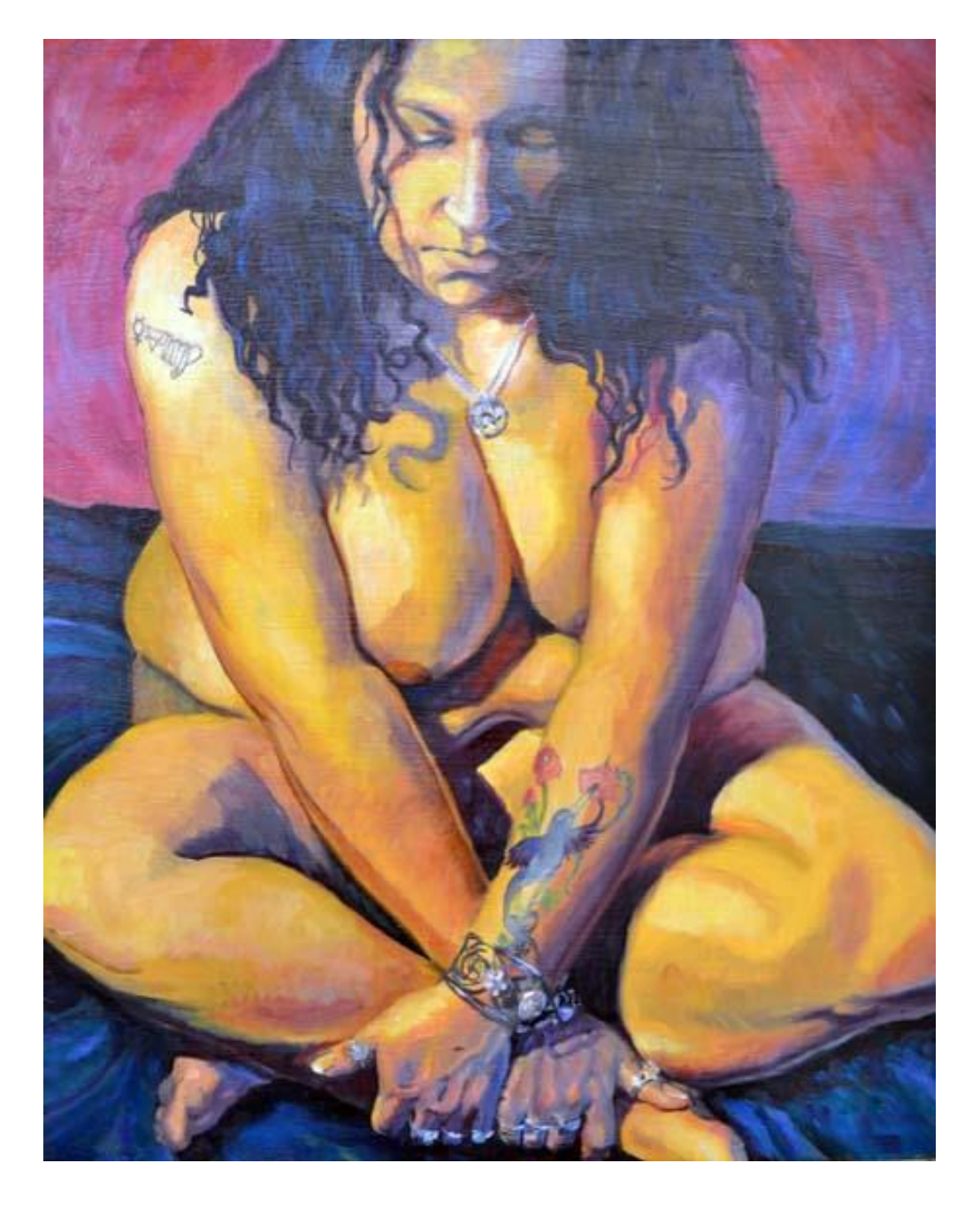
Figure 2 Cecelia Ivy Price, Coming to Confidence II, 2014, Oil on Canvas.