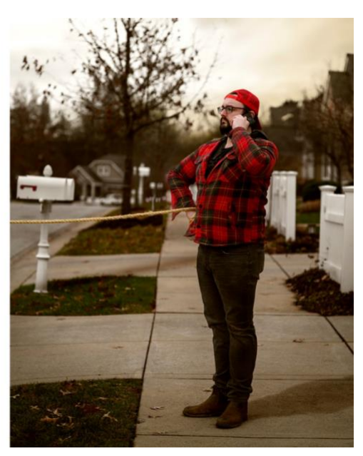
Figure 1 Address the Issue, I am Afraid , 2019. Photograph.