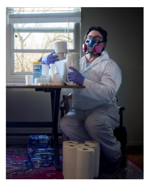
Figure 3 Address the Issue, Please Practice Racial Distancing , 2020. Photograph.