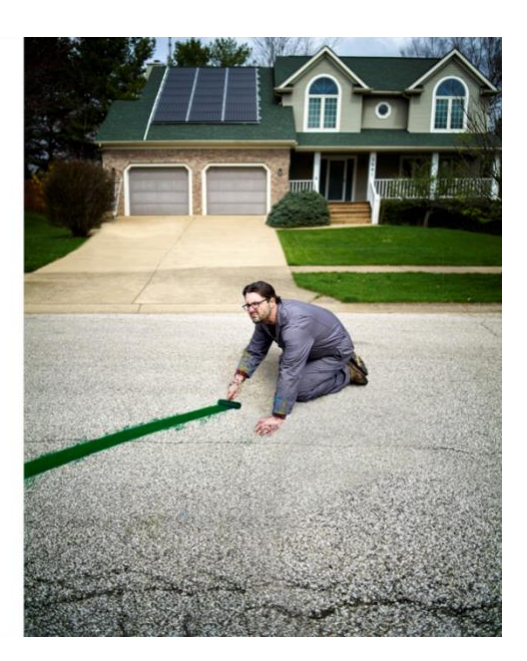
Figure 2 Address the Issue, Keep them out of my Neighborhood , 2020. Photograph.