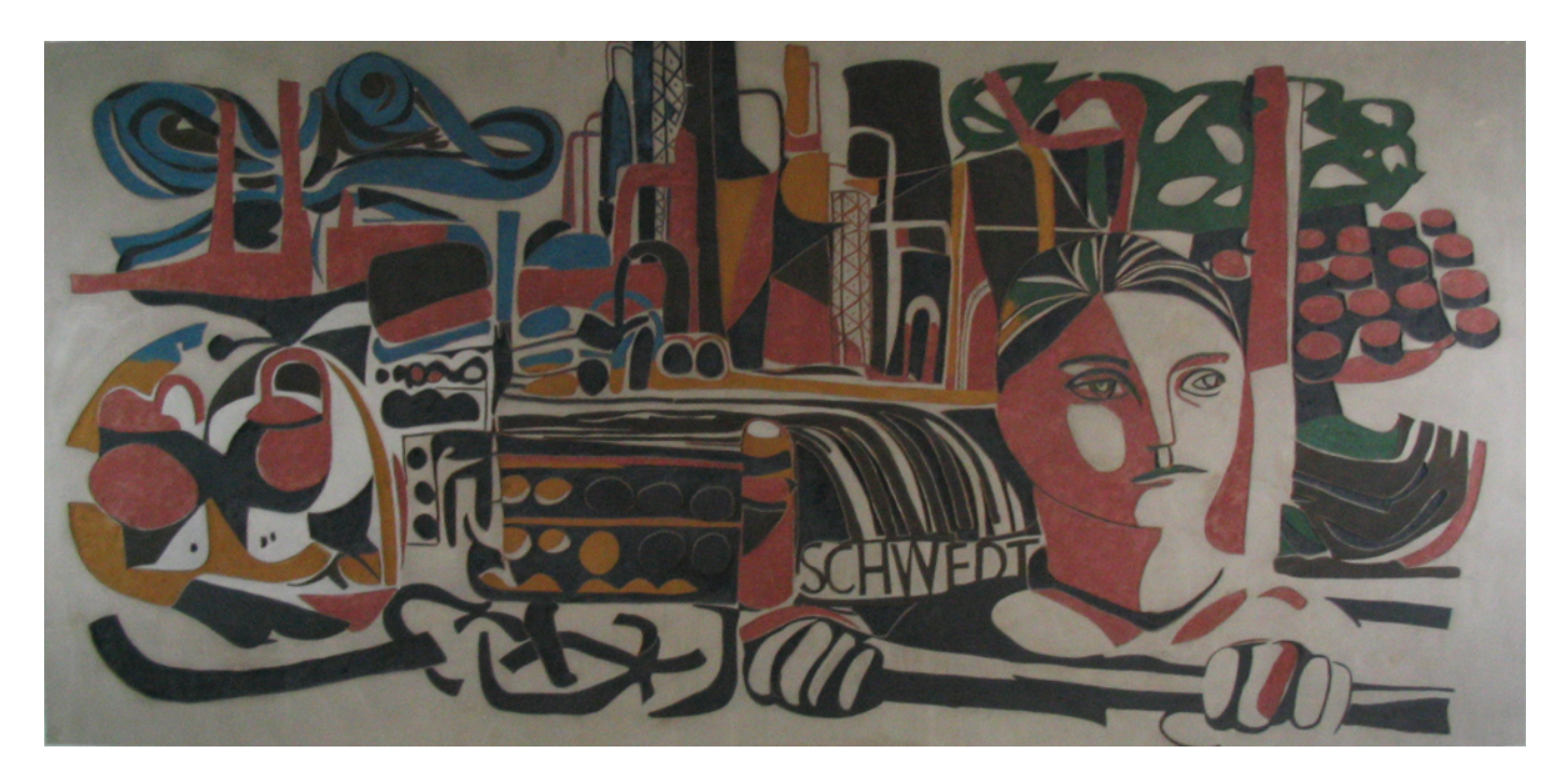
Figure 5 Bernhard Heisig, Schwedt , 1965. Sgraffito. 300 \times 900 cm. Radisson Blu Hotel, Leipzig.

The second debate focused on a new painting in the Paris Commune series that Heisig showed at the Seventh Regional Art Exhibition in Leipzig that fall. Like his murals for the Hotel Deutschland, The Paris Commune (1964, fig. 6) combined multiple moments and events into one image, which showed more than fifteen people engaged in hand-to-hand combat in the final days of the Paris Commune. Early on, critics in Leipzig praised the work as "energetic" and "explosive," a "symphony of dramatic tones" that made "the unstoppable strength of the Communards noticeable." As the exhibition wore on, however, critics from places other than Leipzig began to attack the painting on both stylistic and thematic grounds. These attacks culminated the following spring with an article by Harald Olbrich in Bildende Kunst in which he stated that Heisig's "superficial interests in problems of form... and writhing amorphously doughy masses decidedly limit the Party value of the Commune." 29