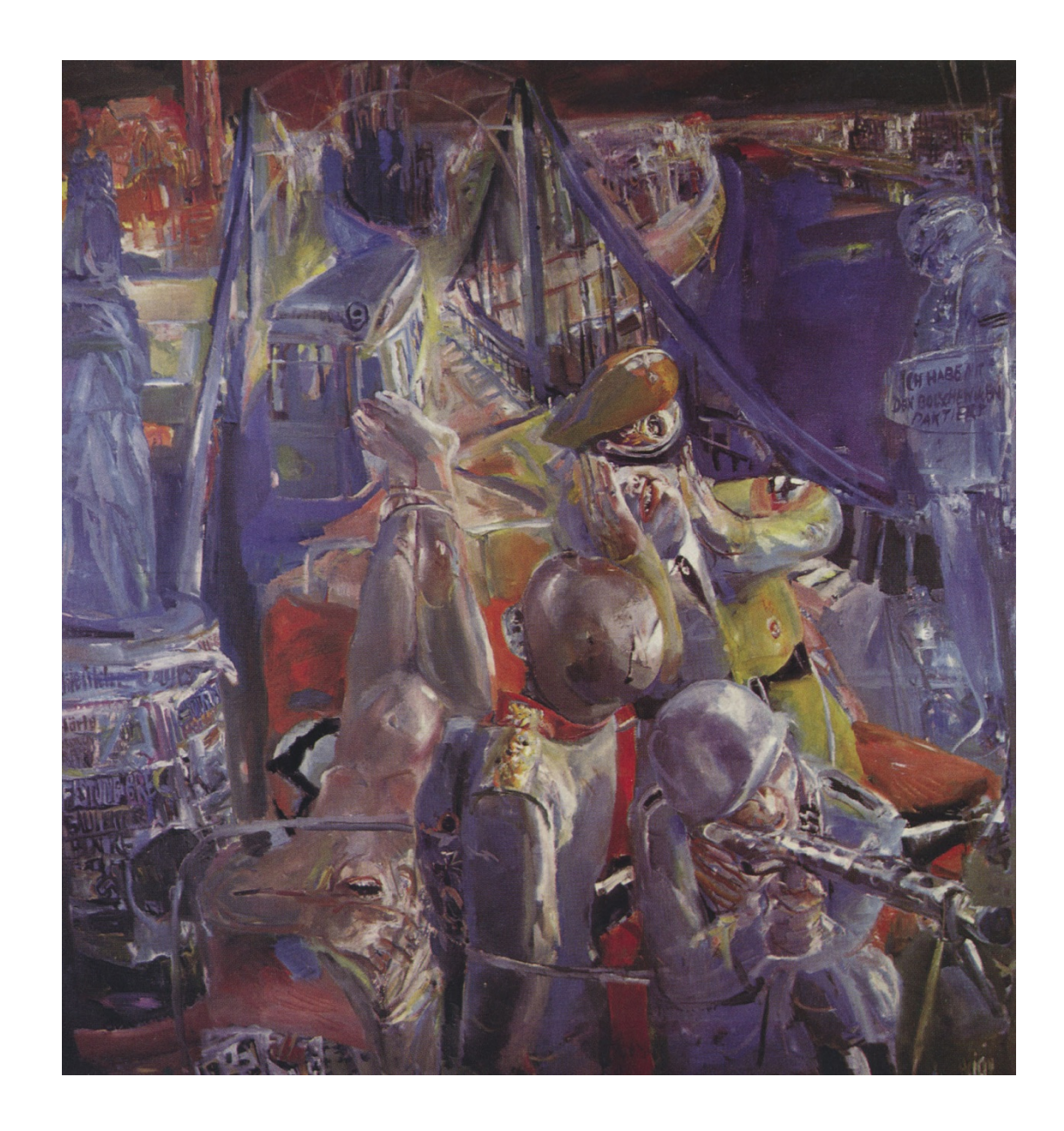
Figure 1 Bernhard Heisig, Fortress Breslau – The City and its Murderers , 1969. Oil on Canvas. 165 x 150 cm. (The painting no longer exists in this form; Heisig reworked it in 1977.)