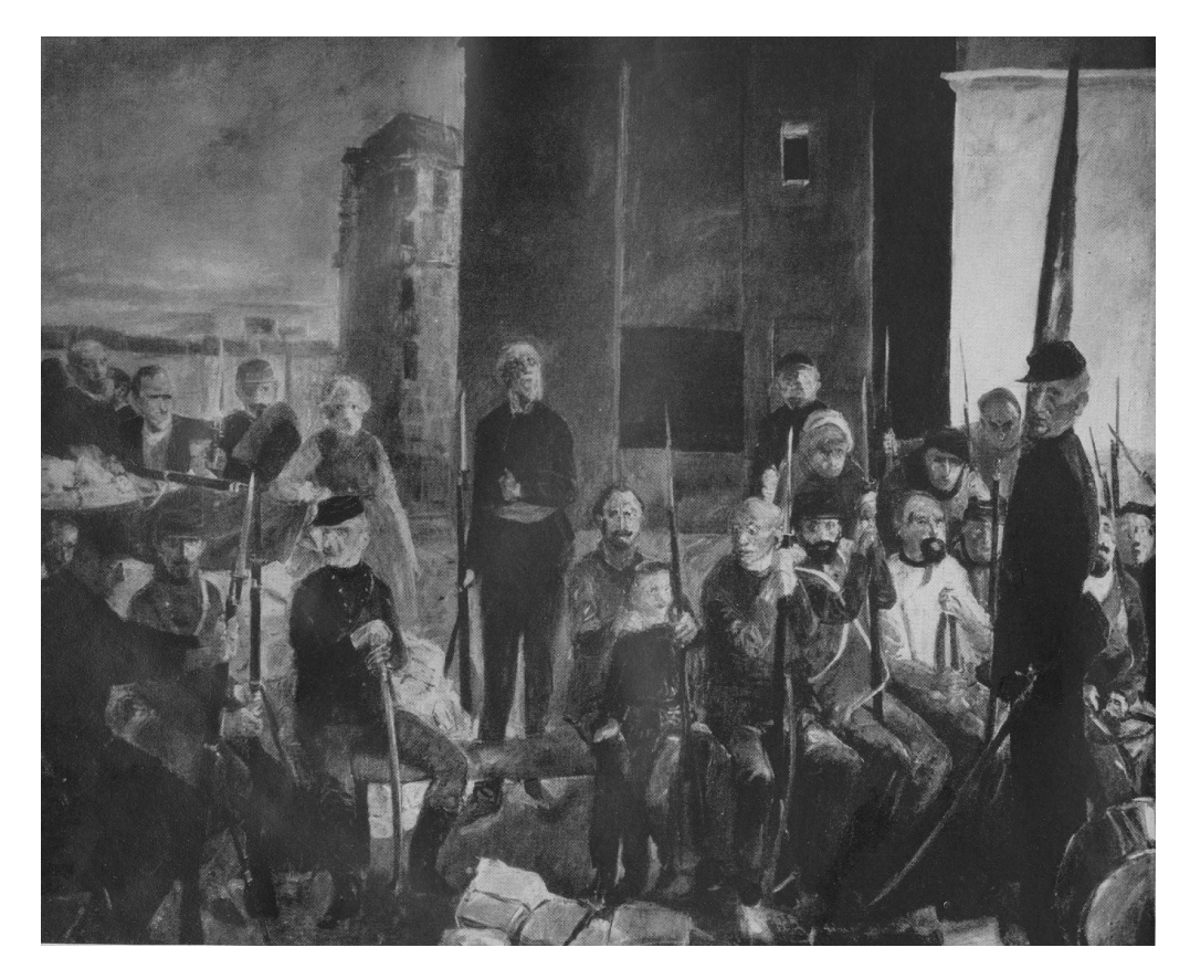
Figure 4 Bernhard Heisig, March Days in Paris I , 1960. Oil on Canvas. 123 \times 153 cm. Destroyed through overpainting.

These texts about Heisig's paintings at the Sixth reveal the importance of art in East Germany, where not only did the head of State visit the exhibition and offer his opinion on some of the works displayed, but the exhibition itself was discussed in great detail in the press. The interest in Heisig's paintings reflected both the importance of the Paris Commune to East Germany and the importance of Heisig's role as one of East Germany's earliest history painters. These early articles also offer insight into Heisig's working process and, in particular, his interest in engaging with others in the creation of his art. As one article noted, Heisig responded to criticisms raised by the jury that the paintings were too static by reworking one of the compositions.<sup>22</sup> This is one of the first mentions of Heisig's tendency to rework paintings, and the reason given is an intellectual rather than emotional one.